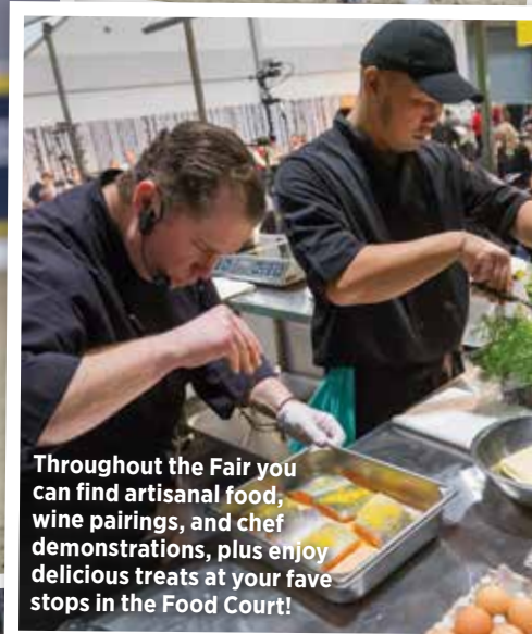
Throughout the Fair you can find artisanal food, wine pairings, and chef demonstrations, plus enjoy delicious treats at your fave stops in the Food Court!