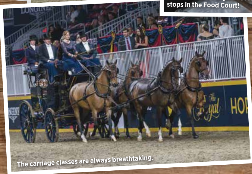
The carriage classes are always breathtaking.

Tickets, schedules and more info at royalfair.org