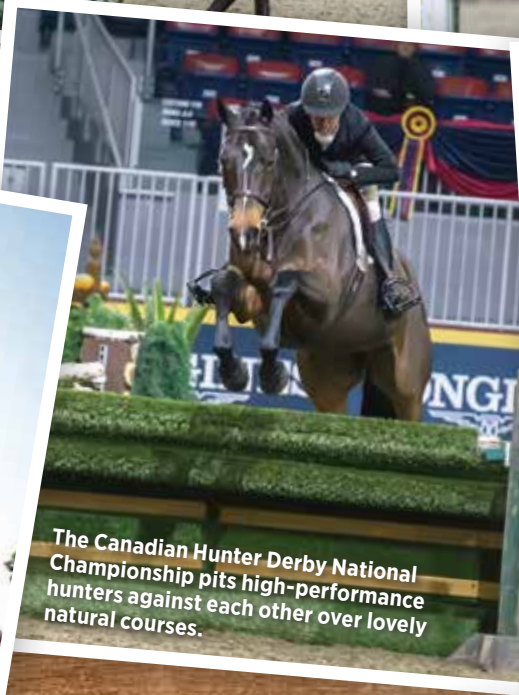
The Canadian Hunter Derby National Championship pits high-performance hunters against each other over lovely natural courses.